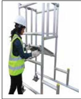
Step 3 Position platform on the 3 rd rung from the top. Apply wind lock. See Illustration 3