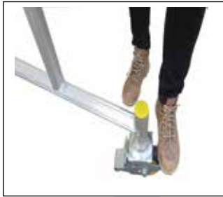
Step 2 Lock all castor wheels See Illustration 4