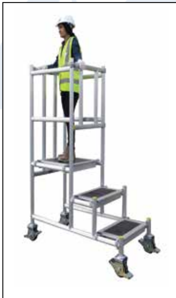
The Complete Structure